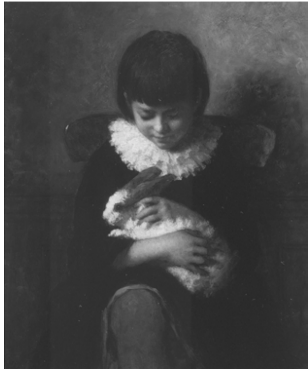
Eastman Johnson, Child with a Rabbit , 1879, oil on wood panel, Museum purchase (1946.32), loaned to the Brandywine River Museum, Chadds Ford, PA, for the exhibition Animals in the Gallery