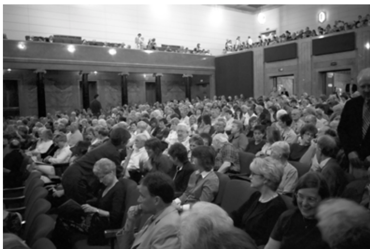
The crowd fills the concert hall for formal remarks at the Russia's Age of Elegance Members Opening , June 4