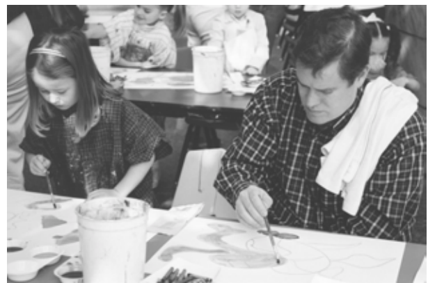
Trinity Learning Center Art-Making Tour for Kids and Parents, April 8