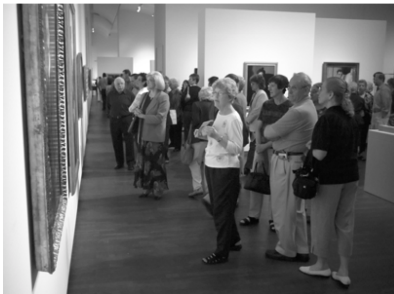
Russia's Age of Elegance Members Opening, June 4