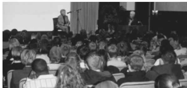
Madame Irina Antonova, Director of the State Pushkin Museum of Fine Arts, speaks to AP history students from OPS, March 25

Third Thursday Art Encounters Club (a partnership with The Nebraska Medical Center's Health & Wellness Club); 12 events; 269 participants