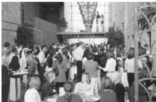
Art on Tap, the Young Art Patrons kick-off celebration, May 4

The Young Art Patrons (YAP) held a kick-off celebration, Art on Tap , announcing Joslyn's newest Patron group. This event provided an opportunity for young professionals to visit the Museum free of charge and meet others who share a similar interest in the arts.