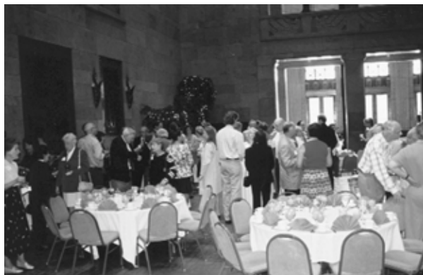
Patron Member Brunch, September 11